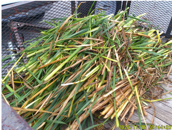
Pond 9b: Pond was an 8 (good condition). Water level is normal.